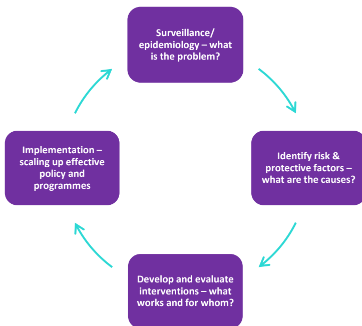
Figure 1. The four steps to a public health approach to violence

The Unit takes a public health approach to preventing violence (see figure 1), which involves seeking to understand the epidemiology of violence, and using this evidence to develop interventions focused on tackling the root causes of violence. Interventions are properly evaluated before being scaled up, if appropriate, to help more people and communities across Wales. Through this approach the Unit aims to develop a whole system response to the prevention of violence.